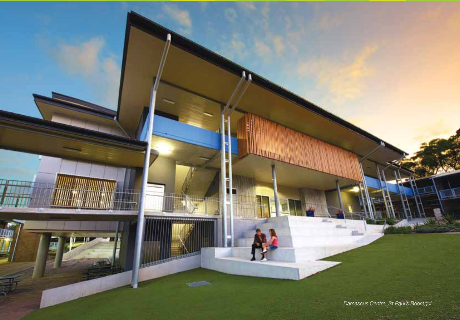
Damascus Centre, St Paul's Booragul