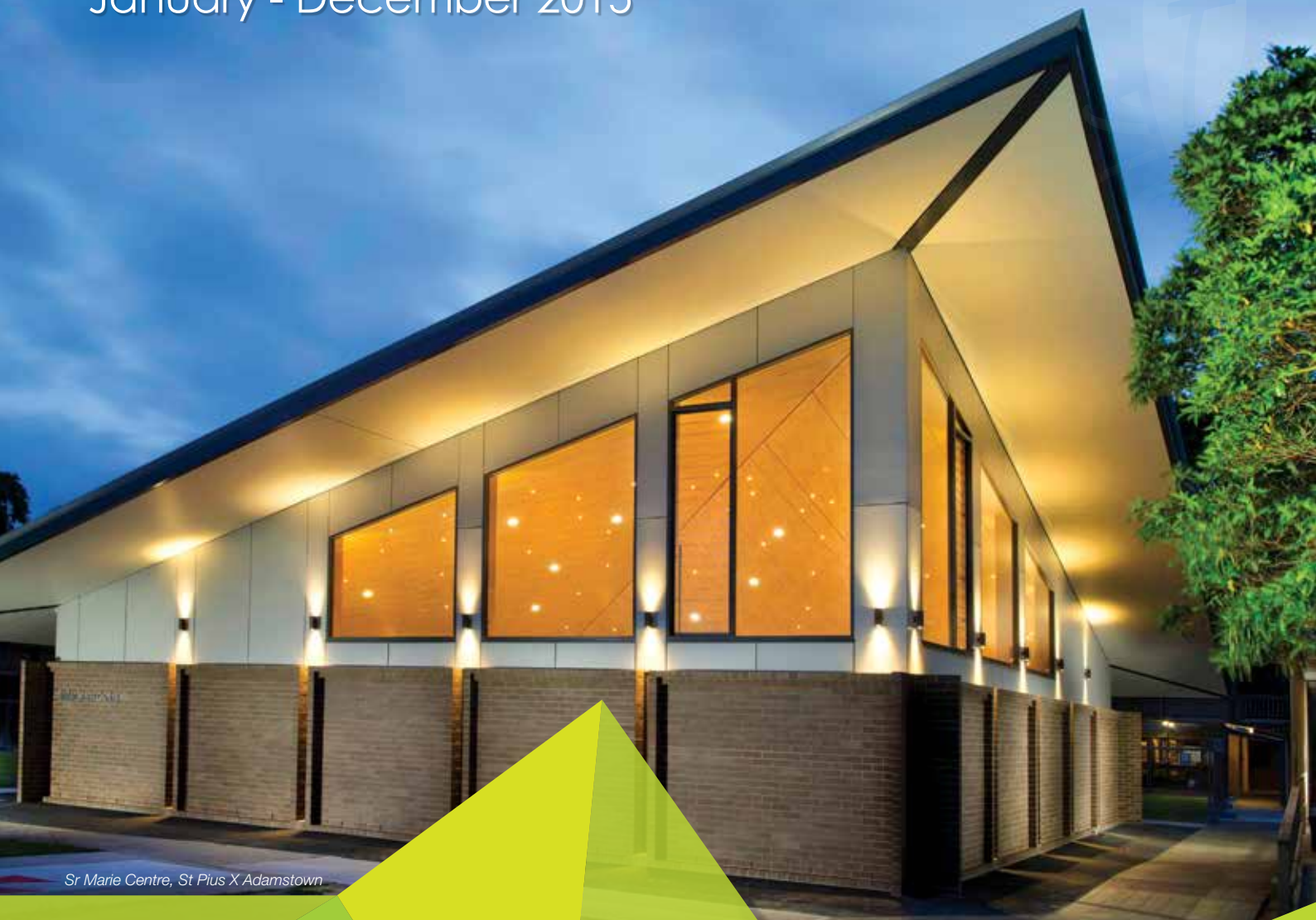
Sr Marie Centre, St Plus X Adamstown